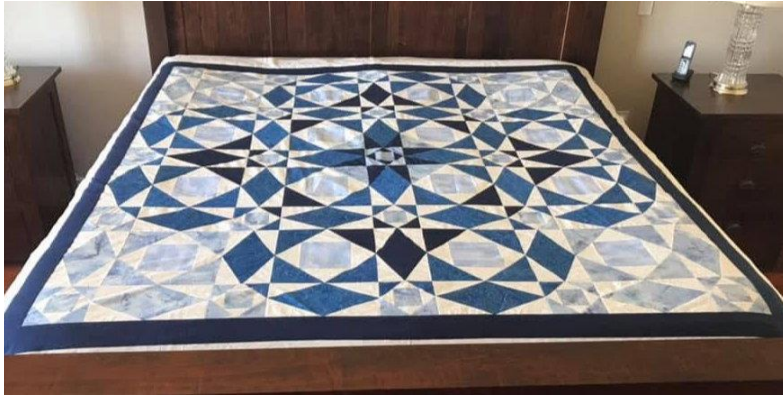
Storm at Sea (King Size)