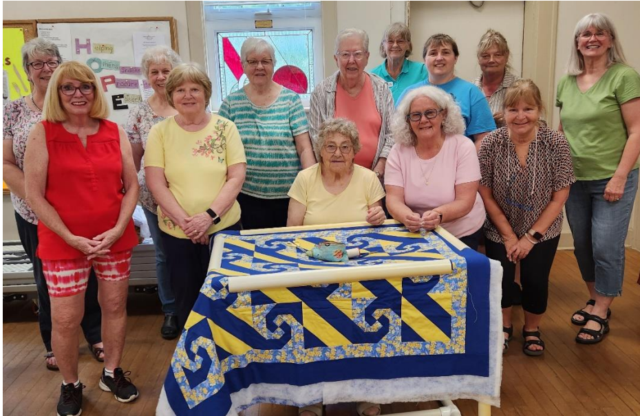
The last meeting of Comfort Quilts in Frankford took place in June.

Mark your calendar: our sewing days will be held on the first Wednesday of the month from September to June. We meet from 9:00 to 2:00 at the Brighton Community Centre (the same hall as our guild meetings). We look forward to seeing you.