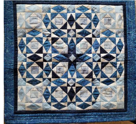
Storm at Sea Miniature