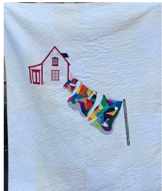
Some Day on Quilts