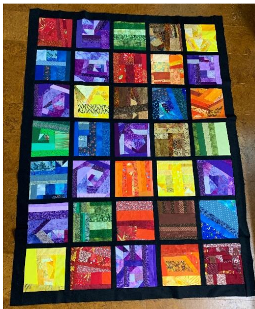
Scrappy Comfort Quilt