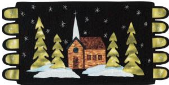
Silent Night Table Topper free pattern

Just a reminder that Comfort Quilts will be meeting in Brighton on Wednesday, December 1..... BUT our Frankford December meeting is cancelled .