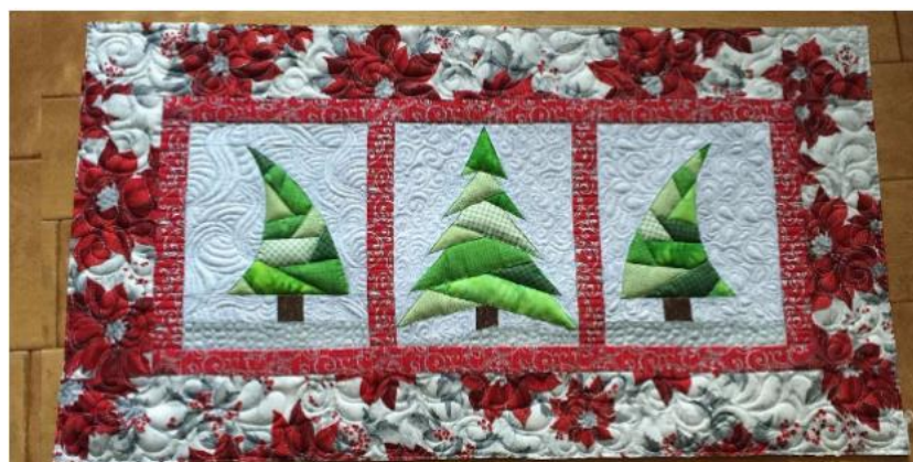
Christmas Tree Trio free pattern