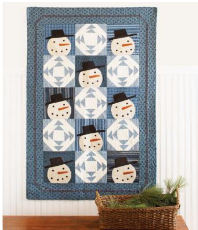
Snow Day free pattern