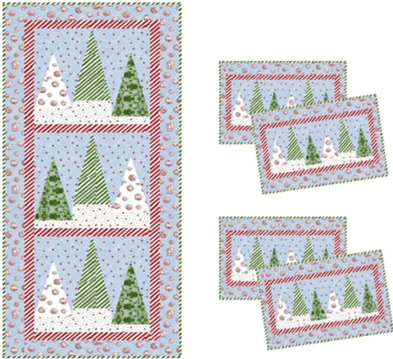
Christmas Tree Farm free pattern